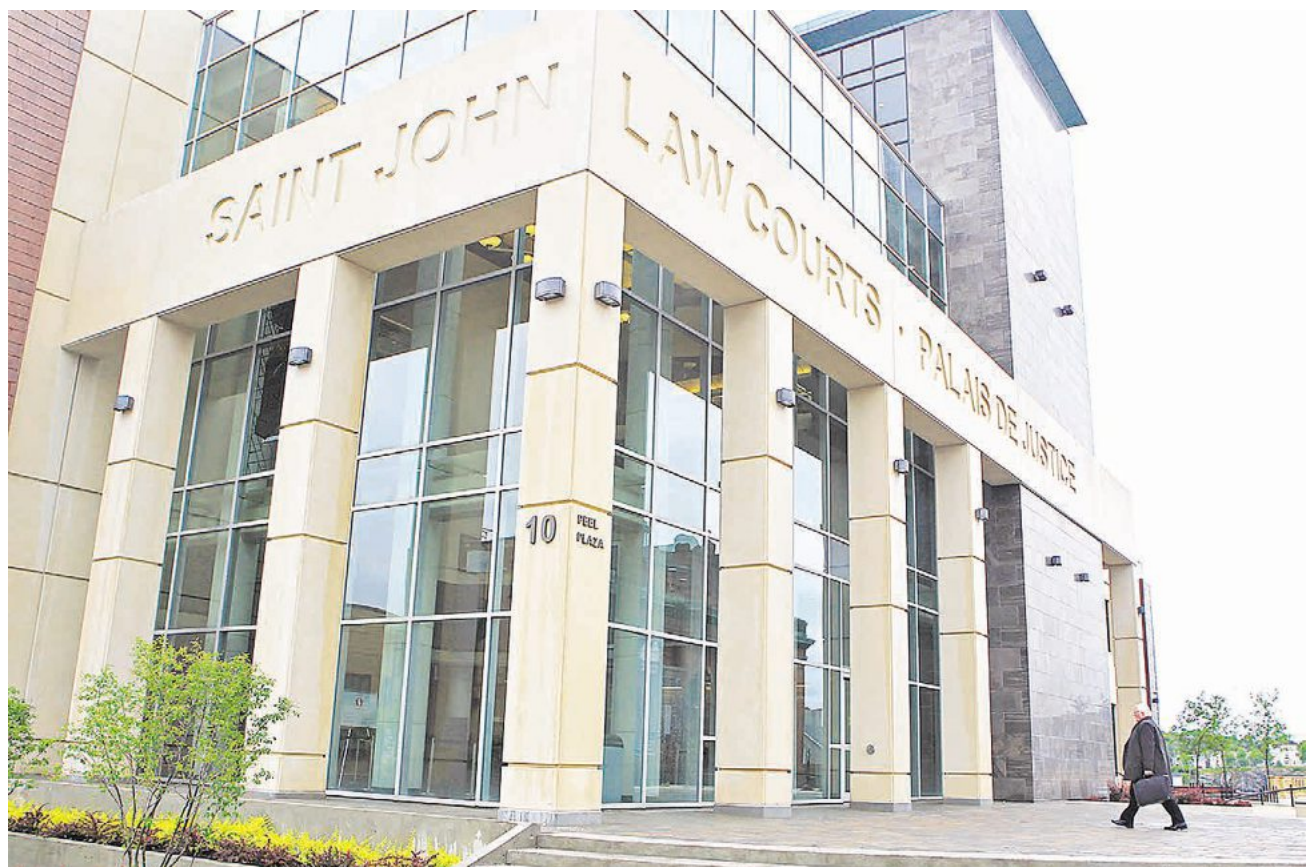
The Law Courts of Saint John